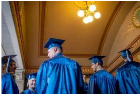
YTI Career Institute graduates wait for the start of Wednesday's commencement ceremony at which nearly 175 students received diplomas. Of all the degrees and diplomas offered, the Motorcycle Technology Center had the most students, at 38.