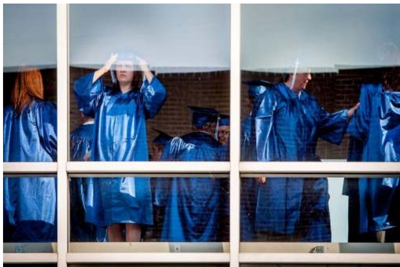
YTI Career Institute graduates get ready in the second floor staging area at the Strand-Capitol Performing Arts Center Wednesday before graduation started.